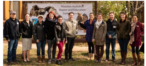
YPAC members at the opening of the Raptor and Education Center

This year, Houston Audubon had a mixed flock of its own move through. This one, however, wasn't composed of birds. Rather, it was made up of fifteen young professionals who together formed the Young Professionals Advisory Council (YPAC). From an associate at a private equity firm to a researcher at Baylor College of