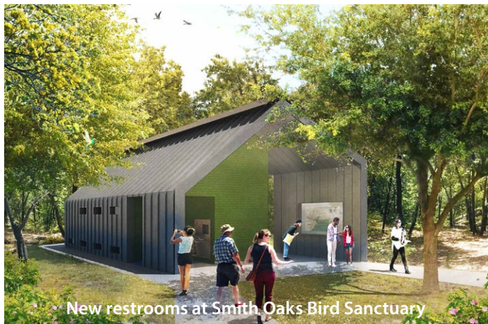
• New restrooms at Smith Oaks Bird Sanctuary

New this spring: We'll open the brand new Kathrine G. McGovern Canopy Walkway in Smith Oaks Bird Sanctuary. This 600-foot elevated boardwalk will provide an interpreted experience through the forest layers, culminating with commanding overlooks at both Smith and Claybottom ponds. We will also open new restrooms in Smith Oaks. Finally, Houston Audubon staff and volunteers will lead guided bird walks on the days that the Tropical Birding guides are recuperating and exploring. Please come see us, we can't wait to share the magic of migration with you. Visit the Houston Audubon website for more information.