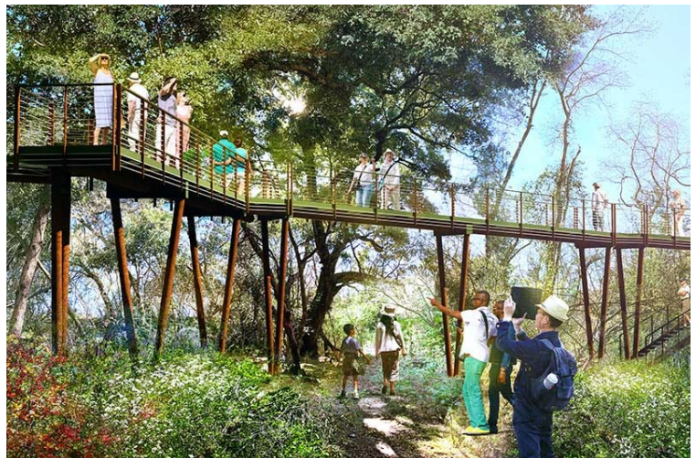
Kathrine G. McGovern Canopy Walkway Currently under construction at Smith Oaks Bird Sanctuary

This event is free and open to the public. Please let us know if you're coming by signing up on the Speaker Event page of our website.