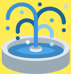
Fresh, moving water