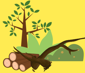
Safe spots to rest or hide