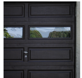
Even small windows can pose a threat to birds.

Research has identified solutions to alert birds to windows. The easiest of these involve applying visible markings to the outside of windows in patterns that the birds can see while requiring minimal glass coverage to keep your view unobscured. Although we don't yet have all the answers, we know that most birds will avoid windows with one-quarter-inch-wide, white, vertical stripes spaced four inches apart, or one-eighth-inch, black, horizontal stripes spaced one inch apart. More complicated or irregular patterns will also work as long as they follow the general spacing guidelines specified above.