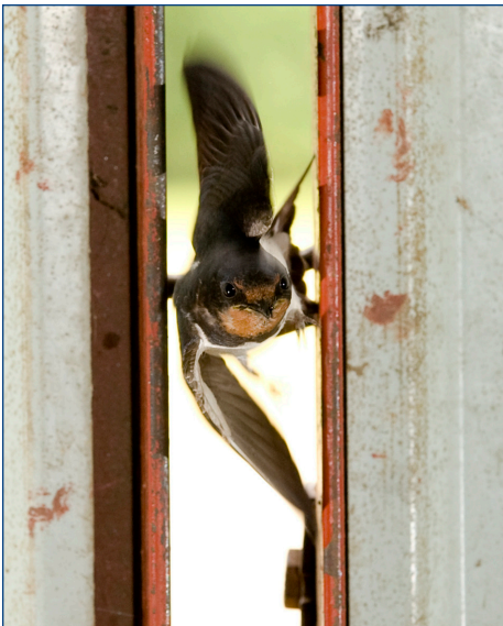
This Barn Swallow dove through the small space shown at top flight speed—over 30 miles per hour!

Not all windows are equally hazardous. Check to see which of your windows are most reflective, and closest to areas where you see birds when they are active. Collisions happen more frequently during spring and fall migration periods.