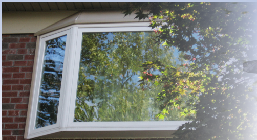
Christine Sheppard, ABC

Millions of birds die every year flying into windows, because they can't tell reflections from trees, plants and sky. Most of those windows are on houses.