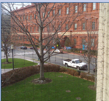
Window netting provides a see-through screen that will cut down on bird strikes.