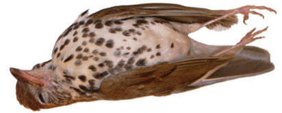
Wood Thrush killed after colliding with a window.

Never had a bird hit your window? Perhaps you have been lucky—so far. More likely, you haven't been around to see or hear it when it happened, and the bird has either flown off to die elsewhere or been scavenged by a neighborhood cat, raccoon, or crow. But the odds are that sooner or later, your windows will kill a bird.