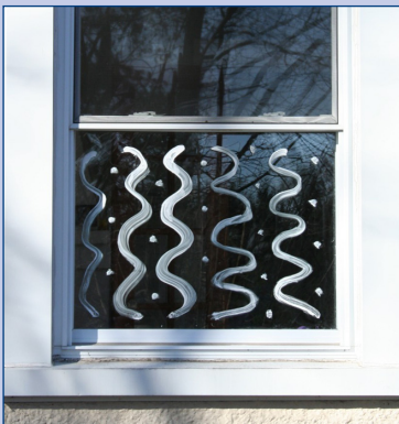
Tempera paint is a washable, long-lasting, and non-toxic solution to preventing bird/window collisions.