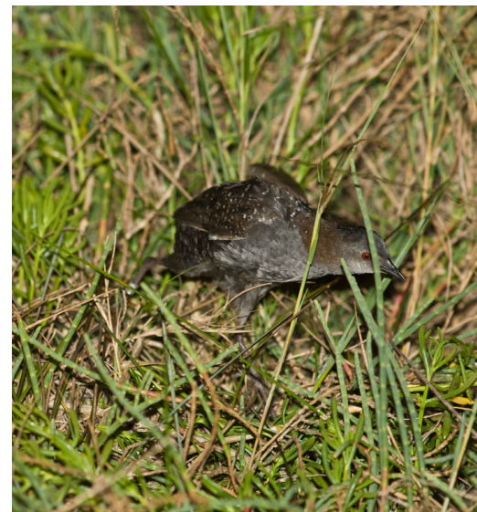
Black Rail

Scan the QR code or visit the link below to learn how you can take action today!