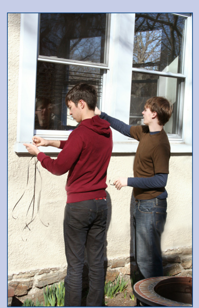
Window tape patterns are easy to apply and provide an effective deterrent against bird strikes.

Here are some quick and affordable ways to protect birds from your windows. These should be applied to the outside of the glass to break up reflections.