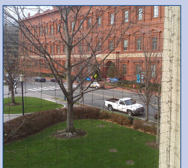
Window netting provides a see-through screen that will cut down on bird strikes.