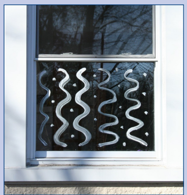
Tempera paint is a washable, long-lasting, and non-toxic